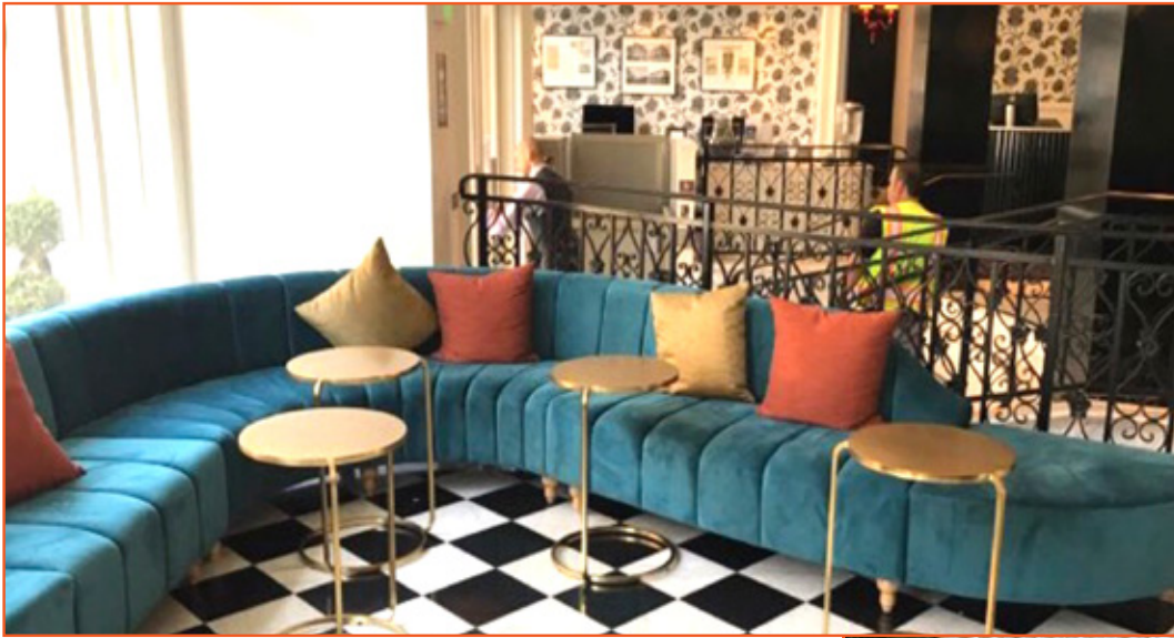
Hotel Shattuck Plaza, Berkeley, CA