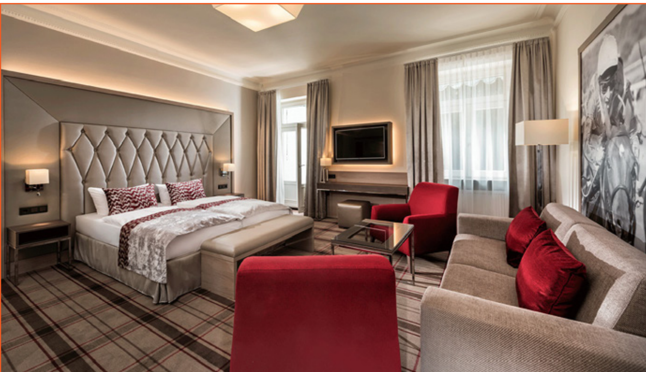
Radisson Blu, Pittsburgh, PA