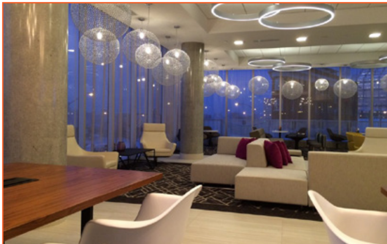
Hyatt Place Downtown Edmonton, Alberta