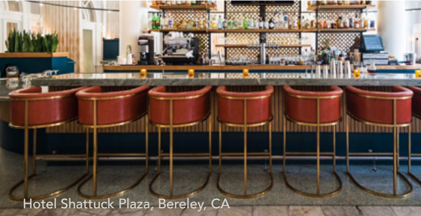
Hotel Shattuck Plaza, Berkeley, CA

This led us on our mission to help fellow hoteliers with one of their largest expenditures for their property--high quality furniture, provided in a timely fashion, and at a competitive price.