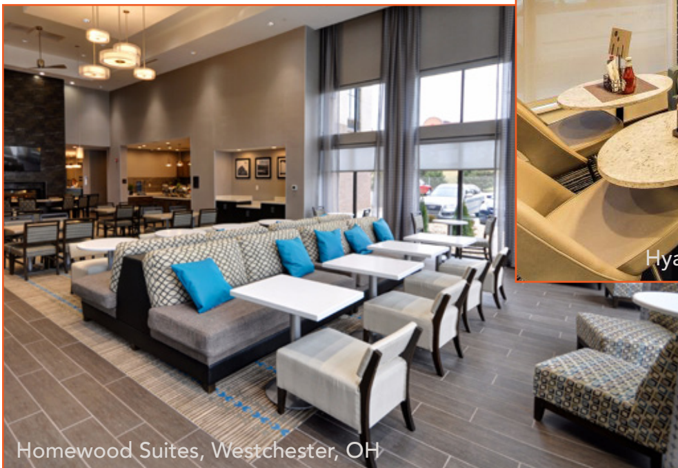
Homewood Suites, Westchester, OH