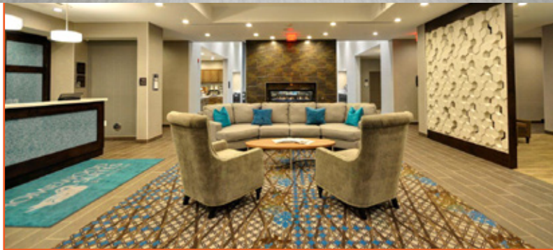
Homewood Suites West Chester, Ohio

Born out of a need to source quality hotel furniture that aligns with hoteliers' renovation/build timelines in 2008, Eclipse Hospitality provides our clients and design professionals with the most versatile, custom-crafted casegoods and upholstered seating for hotel guestrooms and public spaces throughout North America.