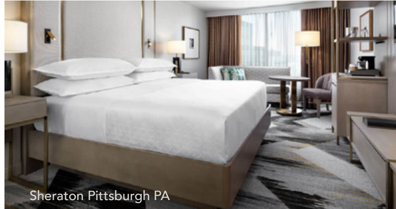
Sheraton Pittsburgh PA