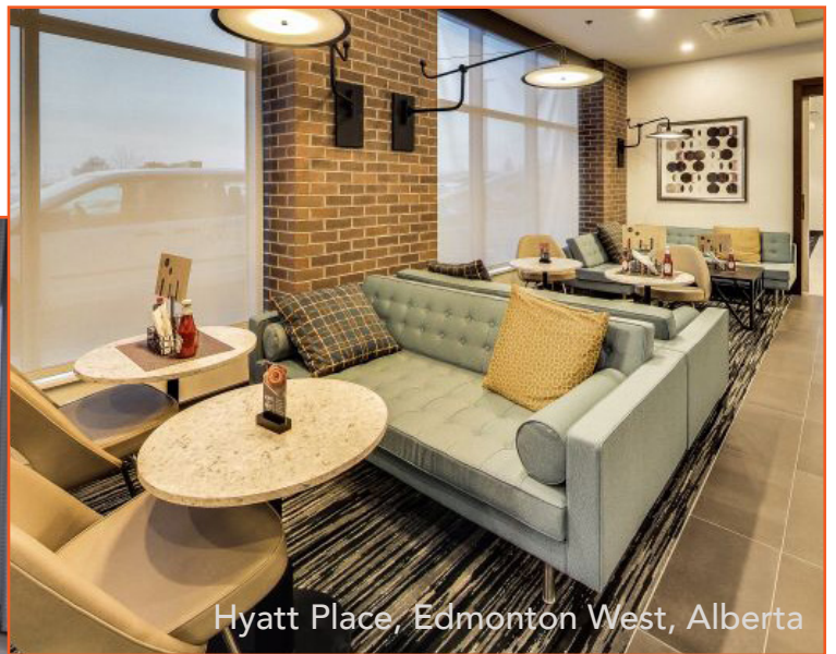
Hyatt Place, Edmonton West, Alberta